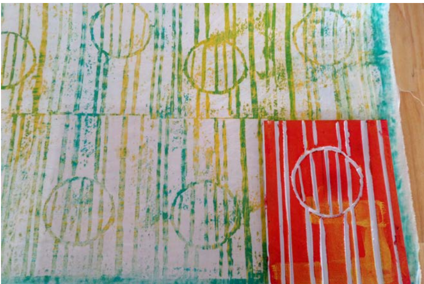
Lines & Circles Fabric: